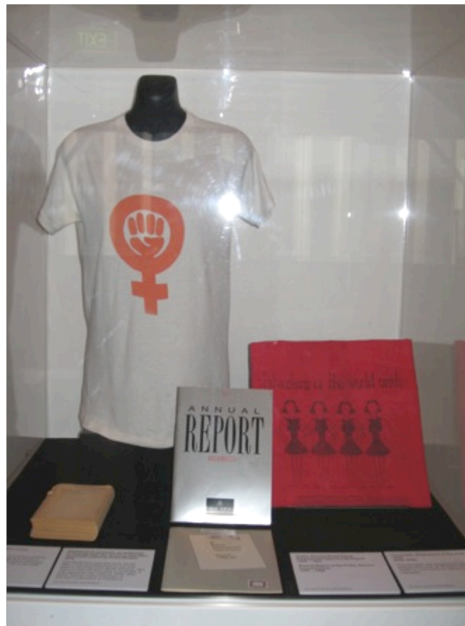
Display cabinet with Women's Liberation T-shirt and tea towel, book and public service reports

involvement in the Vietnam War, opposed conscription and helped to hide draft dodgers.