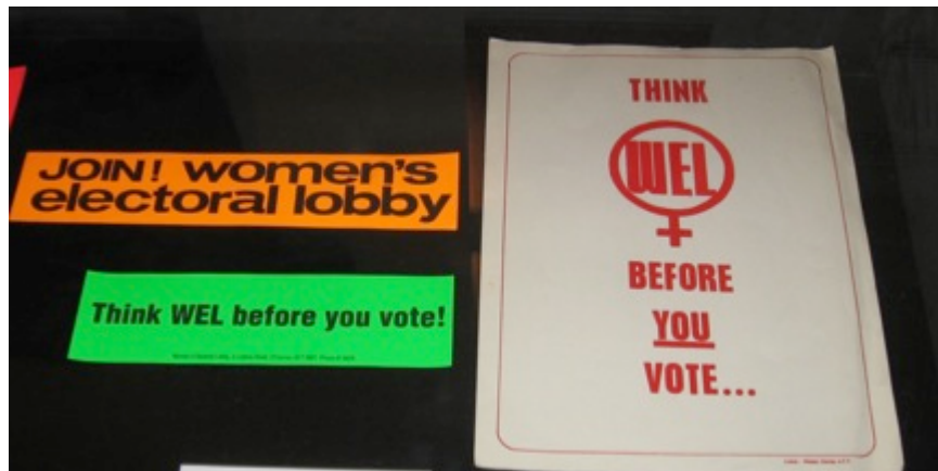
1970s bumper stickers and poster in display

lot of success with these tactics, also a lot of fun.