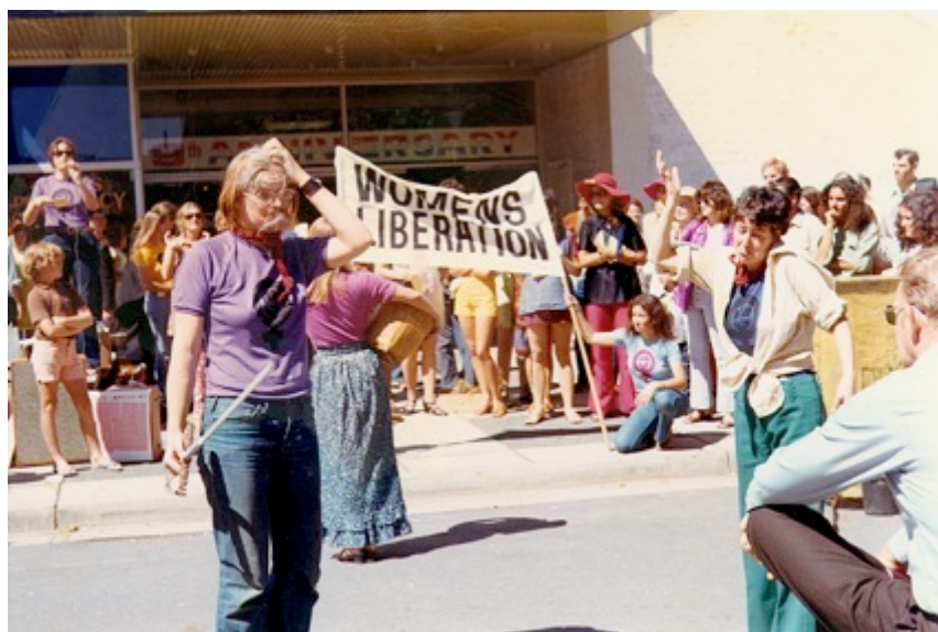
Women's Liberation street theatre, Civic, March 1972

That is not to say that we all wore bras, the bra-less look under T-shirts was very fashionable amongst young Women's Liberation members.