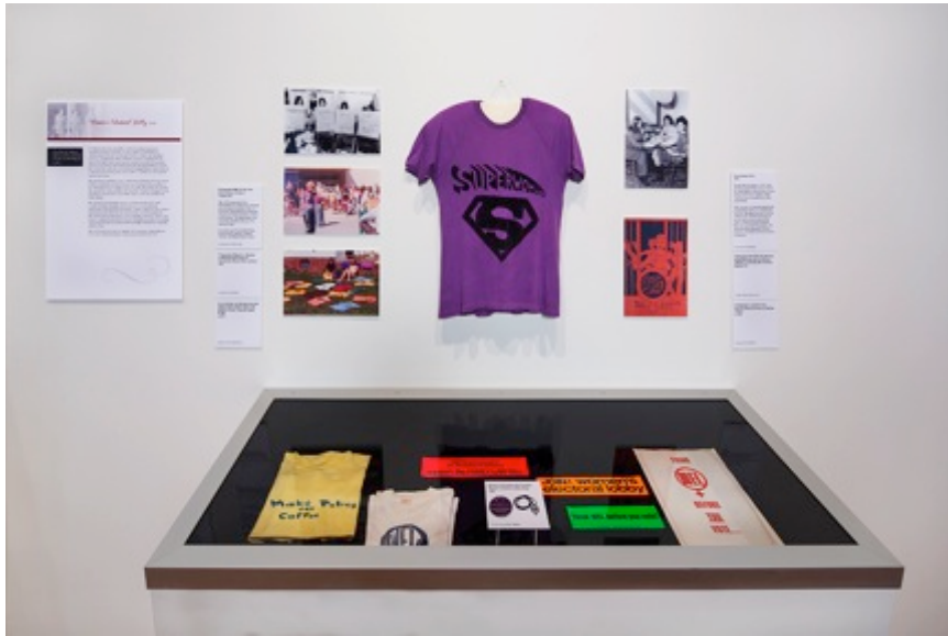
Display with description of WEL, Superwoman T-shirt surrounded by photos, other objects in cabinet.