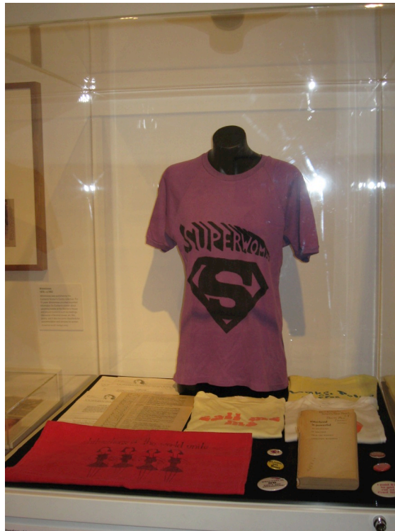
Women's Liberation memorabilia 3

Two months later the action group in Women's Liberation set up the Women's Electoral Lobby of the ACT. These were women who were not prepared to wait for a revolution but wanted action now and wanted to work in the system. They wanted legislative and policy changes by the federal government. What they wanted was much the same as the Women's Liberation demands but usually expressed more tactfully. 4