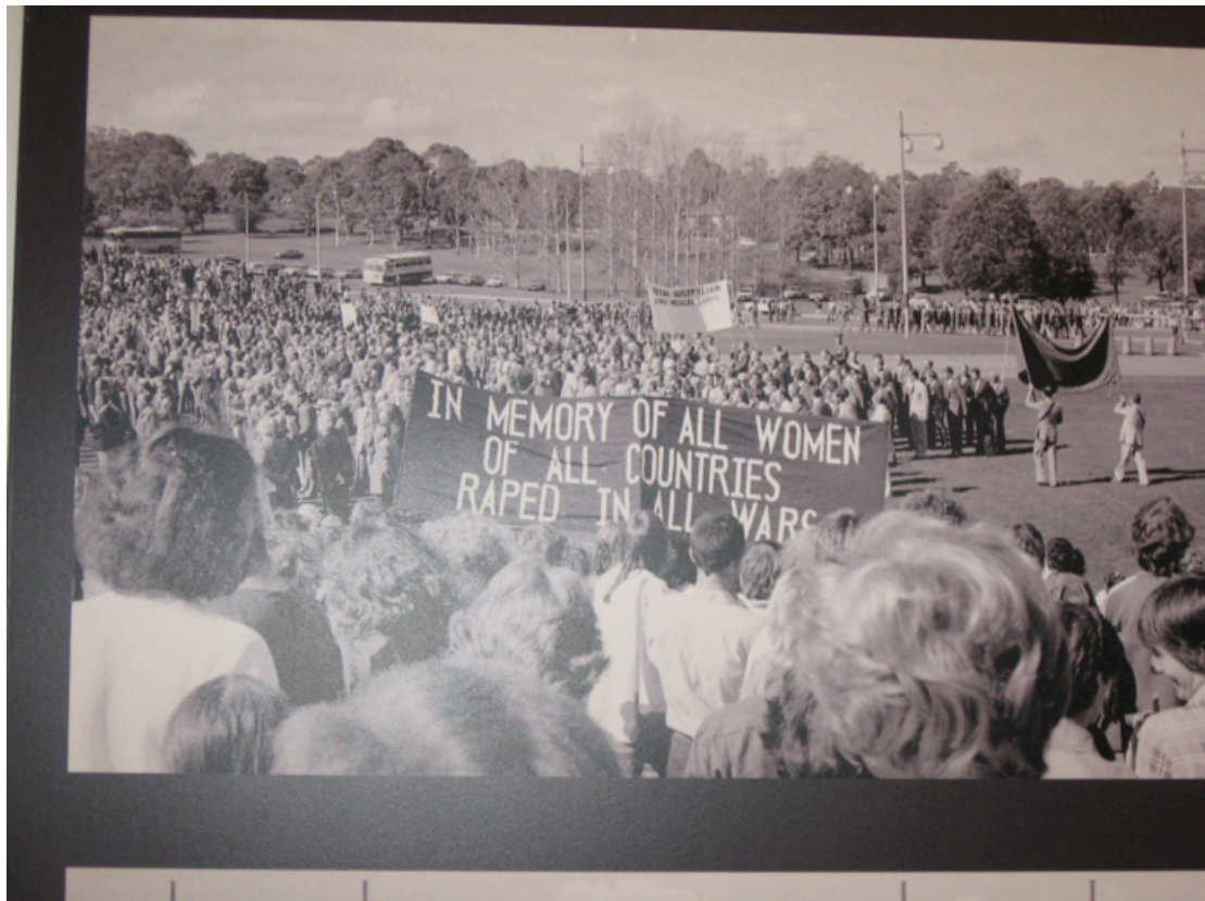
Watching the official march.

The video of the 1982 march was made to use as evidence in court in case women were arrested. However, no women were arrested on ANZAC 1982.