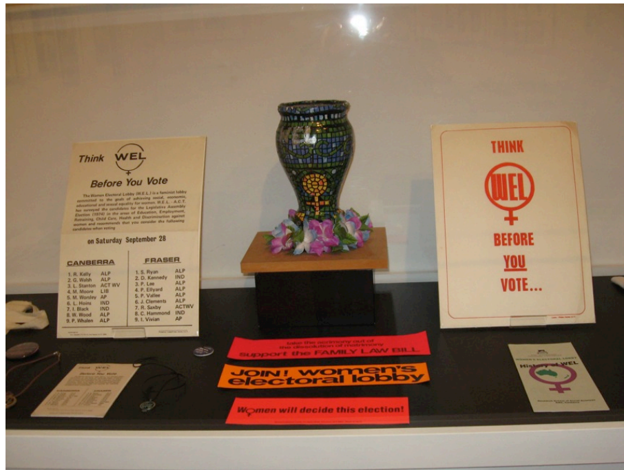
Display case with WEL memorabilia 6

Memorabilia from these two organisations are in the display cases on the right. You can learn more about both of them from two videos that are on the video stand in the centre of the exhibition. 5