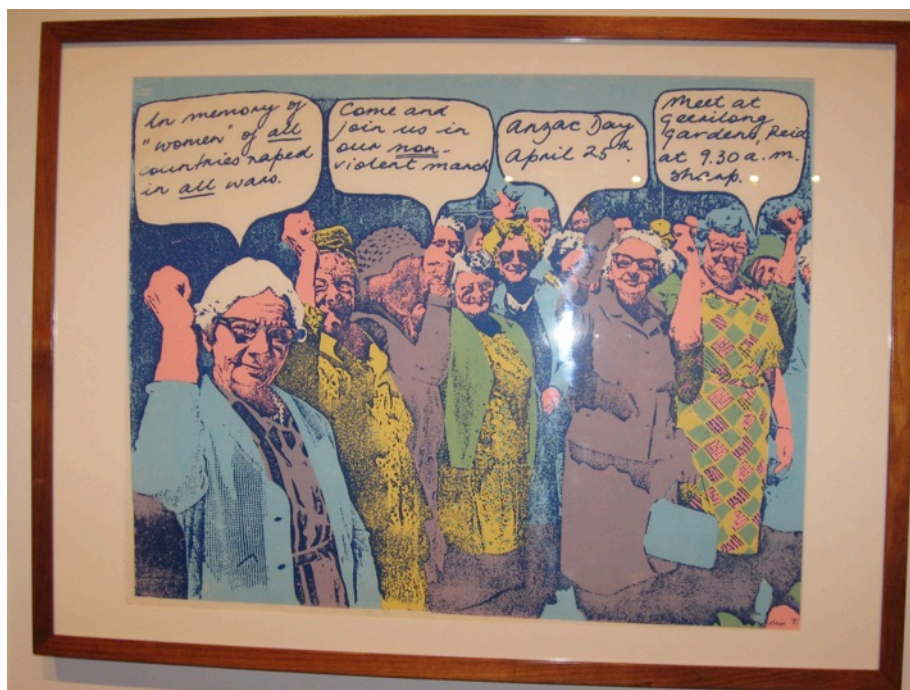
1981 Canberra WAR poster, courtesy Sue Waddell-Wood

That is not to say that Canberra WAR and other WAR groups were responsible for all this change, but they can be credited with starting the conversation.