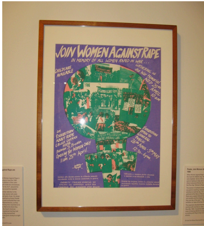
1984 poster.